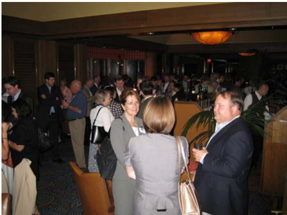
The annual WindPAC Reception at the AWEA Fall Symposium drew a large crowd.